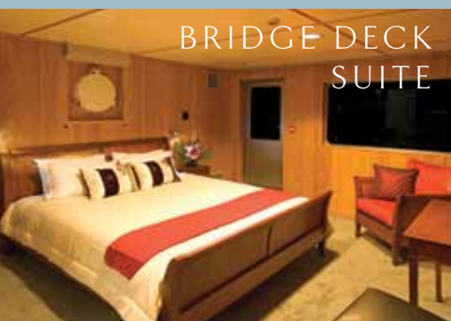
BRIDGE DECK SUITE