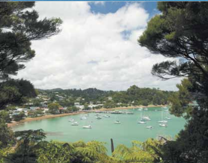
Historic Russell, Bay of Islands