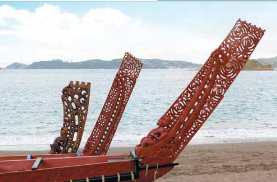
Maori War Canoes, Waitangi

We cruise through the islands late afternoon to anchor in beautiful Paradise Bay, Urupukapuka the largest Island in the Bay. Tonight we enjoy our chef's sumptuous gourmet BBQ with fresh seafood and produce from the local farmers markets.