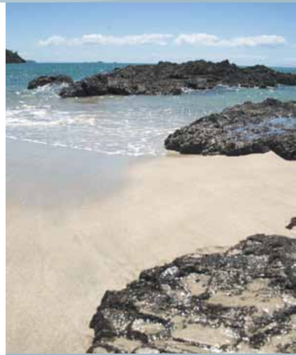
Onetangi Beach, Waiheke Island

ON YOUR WAIHEKE ISLAND ESCAPE you can be as active or laid back as you choose. After an evening cruise, fine dining and a great night's sleep, you'll wake fresh and ready to explore the island. Discover the magnificent marine environment, walk barefoot on sandy beaches, take a guided tour of some leading New Zealand vineyards or relax with a book in a steamer chair – it's up to you. We'll help you find the kind of relaxation you need.